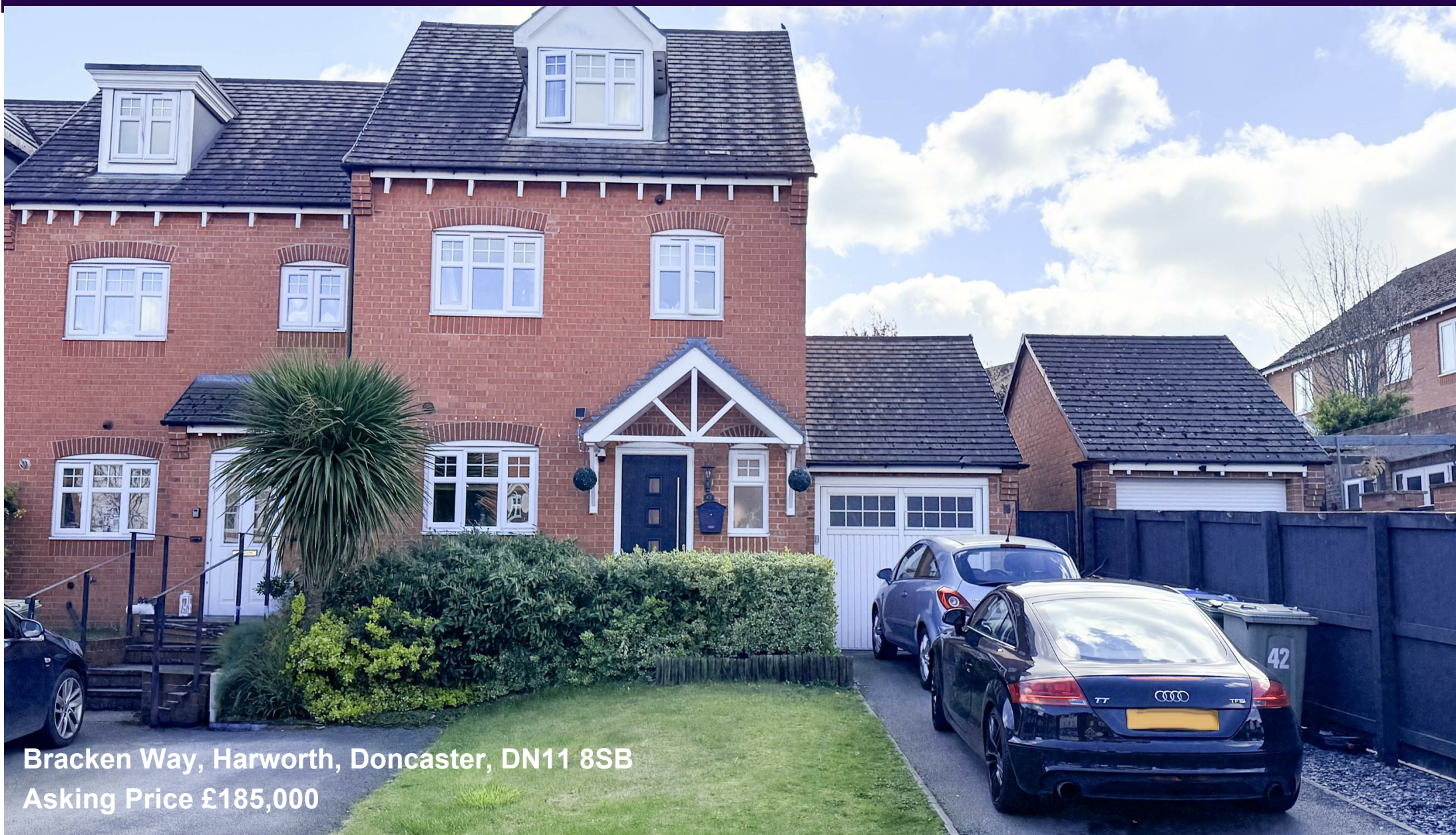
Bracken Way, Harworth, Doncaster, DN11 8SB Asking Price £185,000